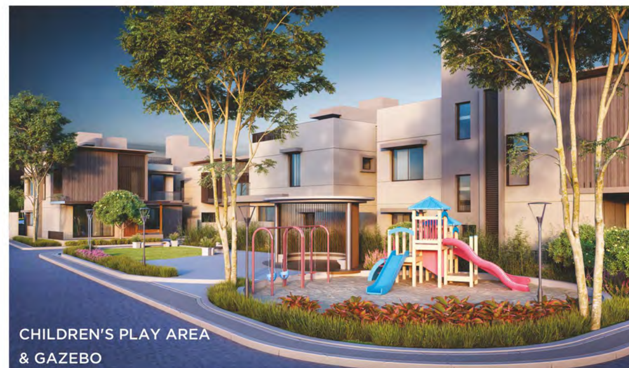
CHILDREN'S PLAY AREA & GAZEBO

An in-campus clubhouse for your health and well-being, indoor games room to share quality time with friends and family, multi-purpose hall to host special occasions in style – all this and more await at Narayan Nandan.