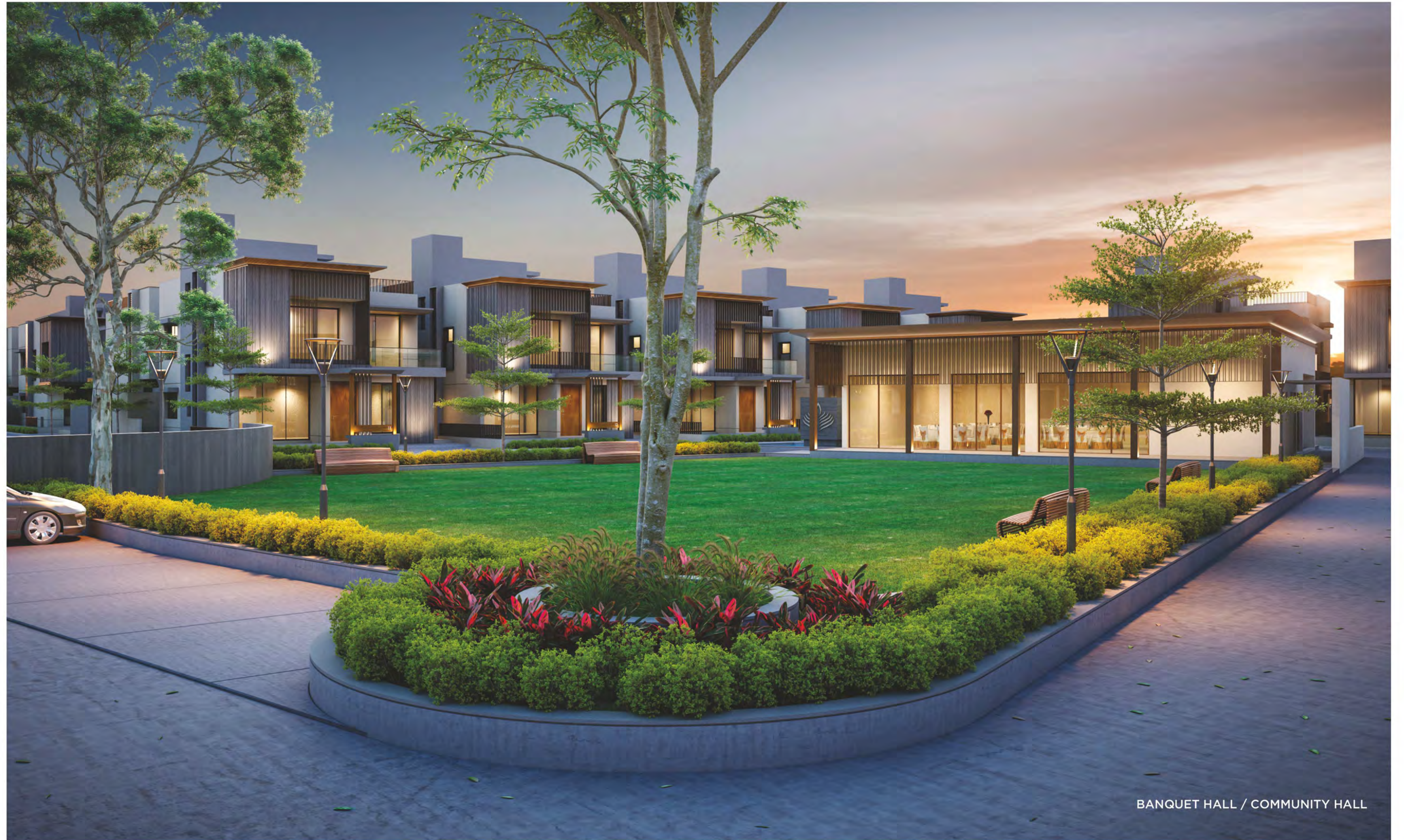
BANQUET HALL / COMMUNITY HALL