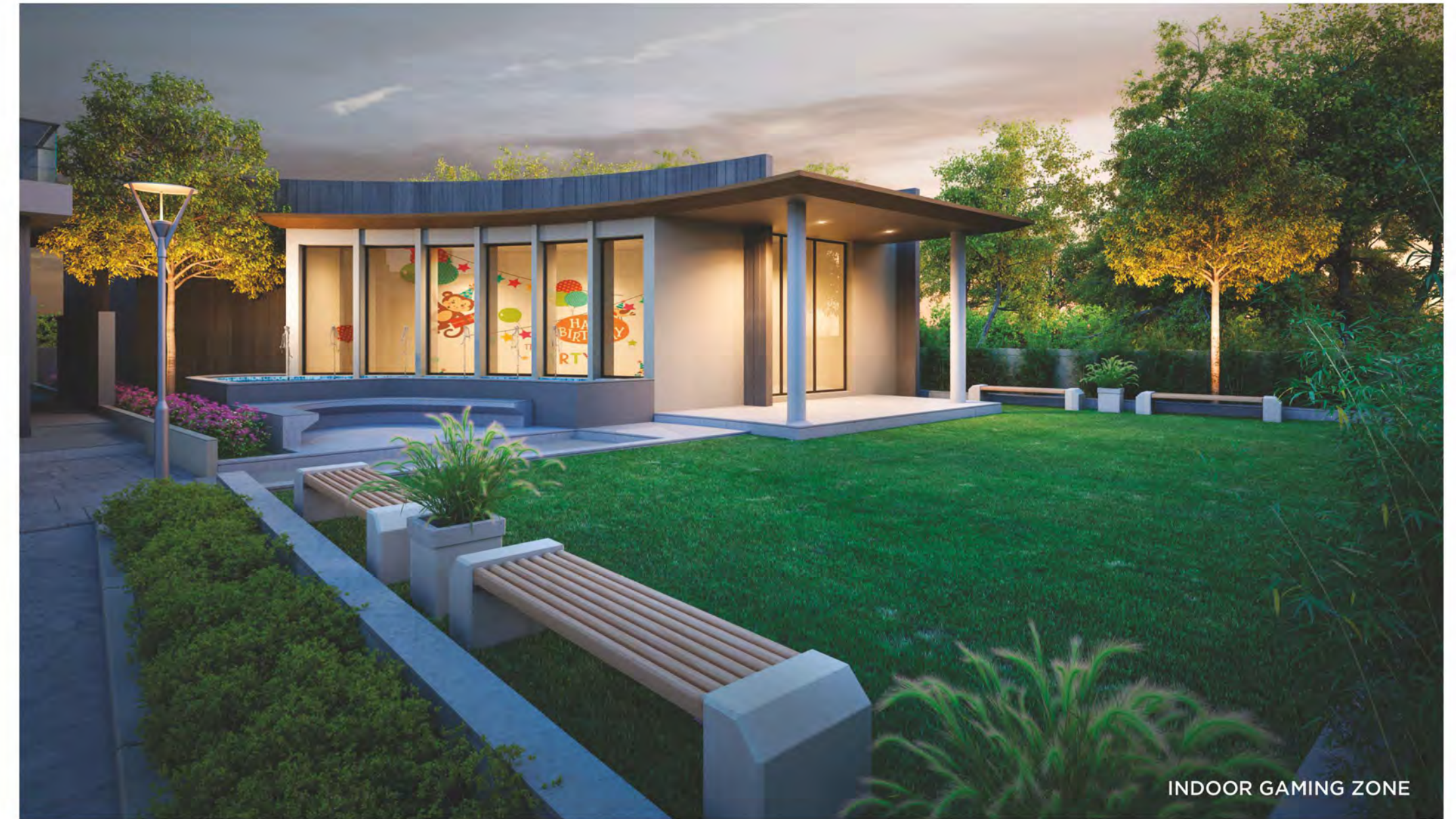
INDOOR GAMING ZONE