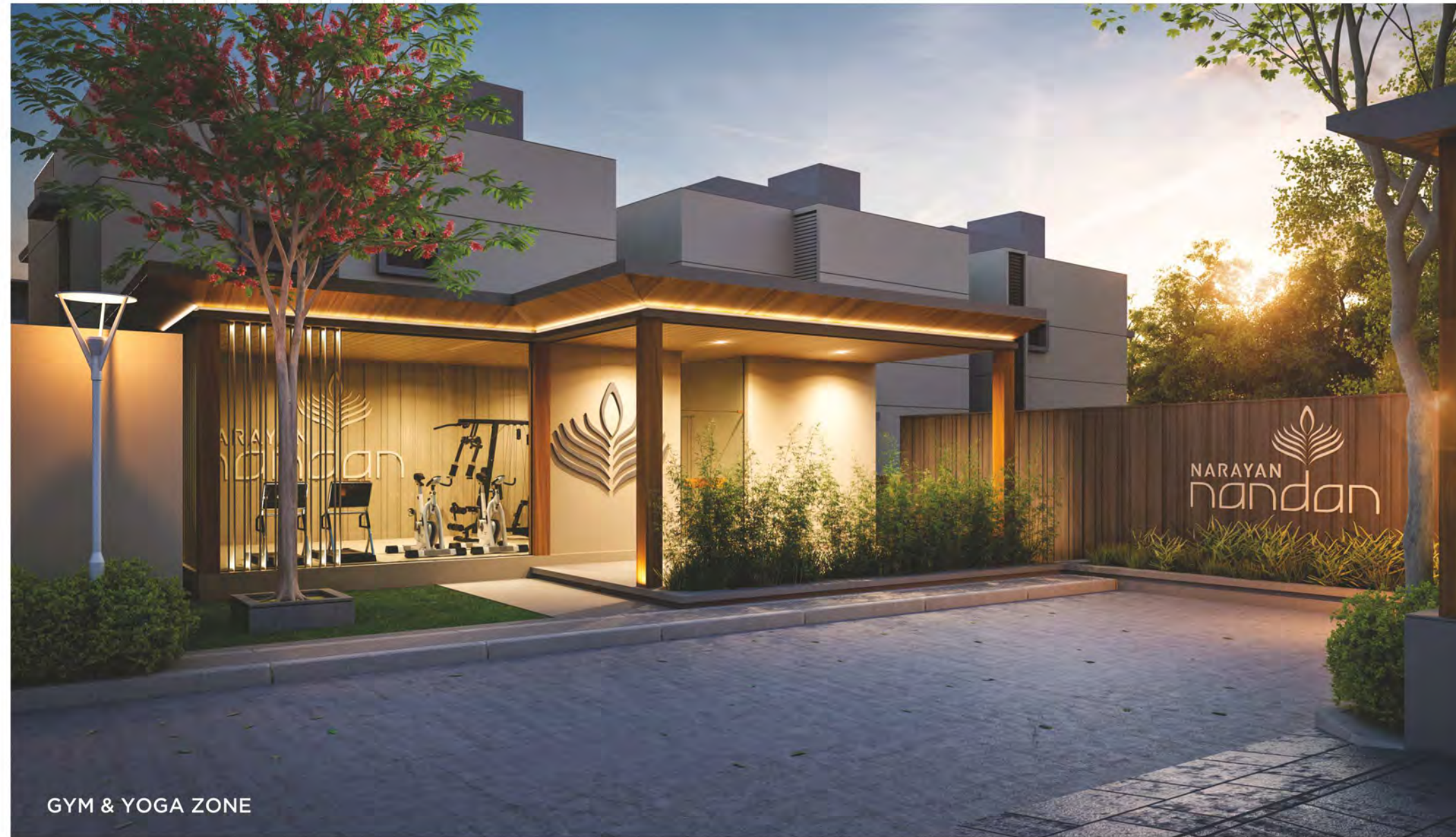
GYM & YOGA ZONE